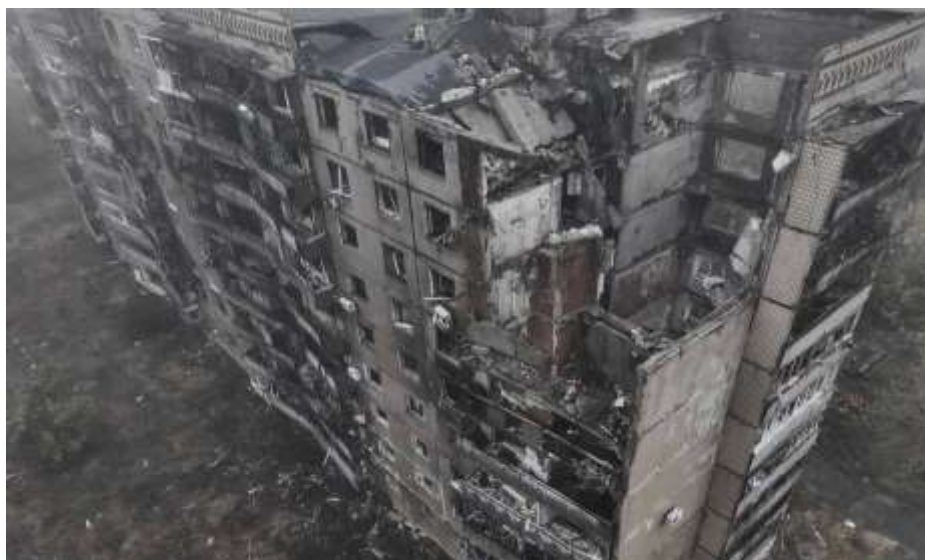
Fig. 7. Ukraine, Donetsk region, Avdiivka. Consequences of shelling of residential areas during the russian invasion, 2023

War has long-lasting social and psychological consequences on the residents, including post-traumatic stress and other health problems.