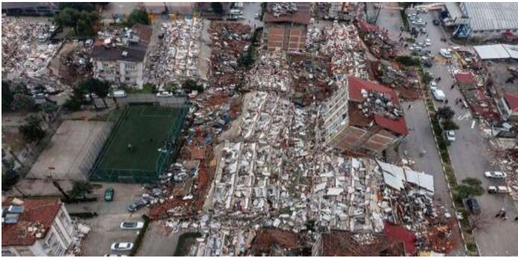
Fig. 3. Turkey, Gaziantep city. Effects of the earthquake and destruction in the residential blocks, 2023