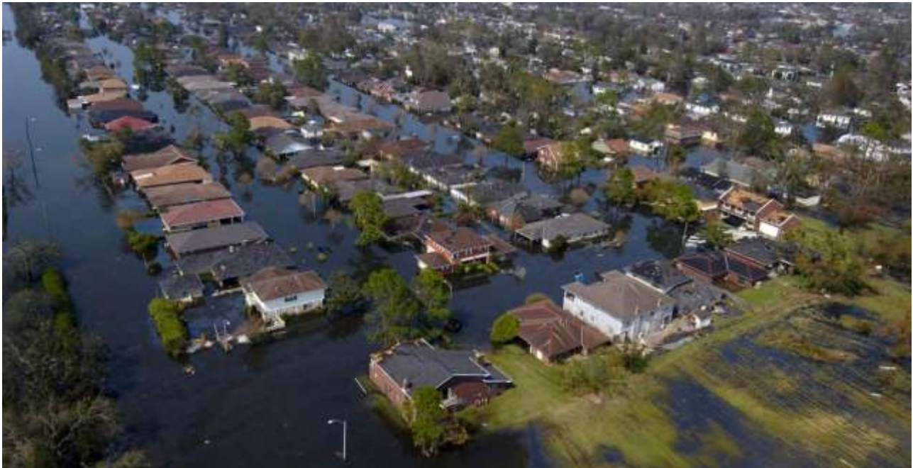
Fig. 2. USA, Los Angeles, New Orleans. Residential development and flooding (Hurricane Katrina), 2005

The studies show that it is the so-called affordable and social low-rise housing that is most often affected, as its residents are the most vulnerable group of the community.