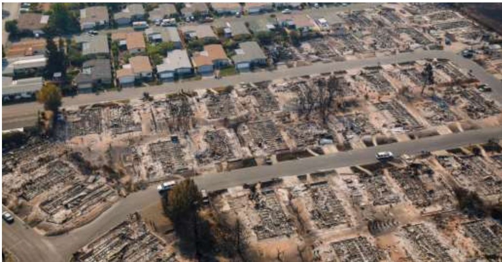
Fig. 4. USA, California, Santa Rosa. Effects of the wildfire and affected low-rise residential buildings, 2017

Pandemics. The global diseases – the pandemics, such as COVID-19, can lead to a large spread of disease and require the control and treatment measures. In the short term, such large-scale crises have a significant impact on the urban development. For example, the COVID-19 pandemic has had a significant impact on the residential development in modern cities, causing a number of changes and trends.