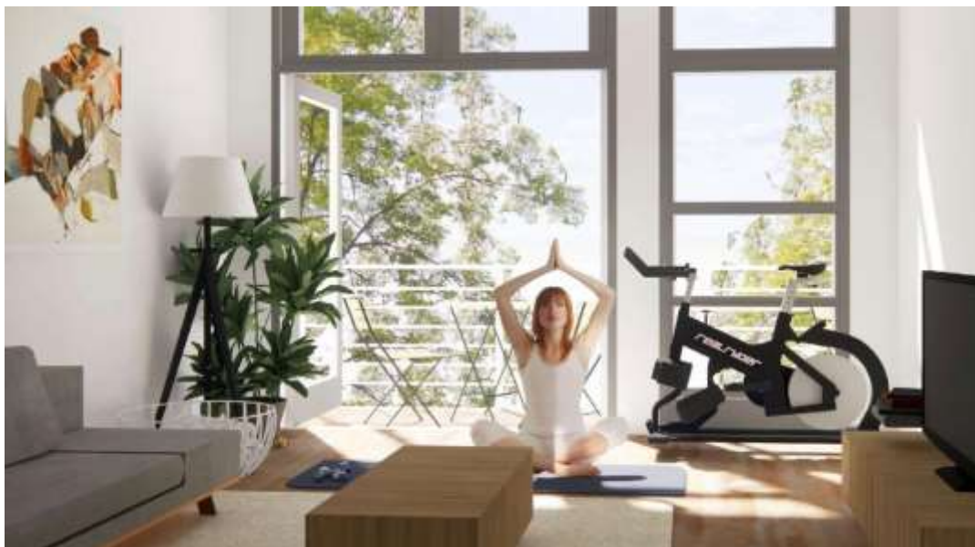
Fig. 6. Typical layout of a 1-room apartment – visualization by Grimm+Parker, 2021

Another aspect is the impact on property values. In some cases, the pandemic has had a short-term impact on housing prices. The large cities became less attractive for some time period due to the risks associated with the pandemic, while smaller towns and districts gained popularity. In some cases, the pandemic has led to rethinking of urban densities, including more space for green areas and open spaces.