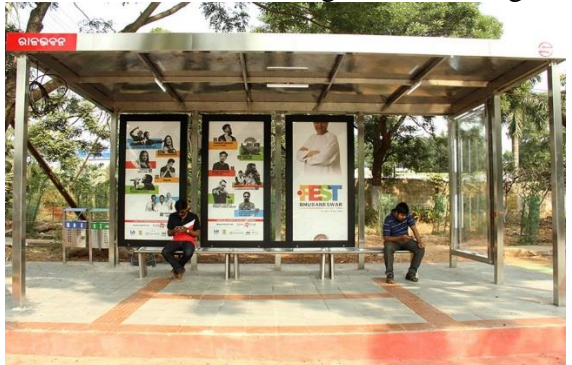
Fig. 1. Bus stop in Bhubaneswar, India

Modern technologies make it possible to create a variety of materials for covering stops, such as rubber, concrete, ceramics, natural stone, plastic and others. The final choice of material depends on the requirements for safety, durability, as well as the design and overall concept of the bus stop. As example of a good functional and aesthetic coating, the following design is considered, Fig. 1.