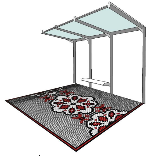
Fig. 4. The 2<sup>nd</sup> option of layout for paving slabs