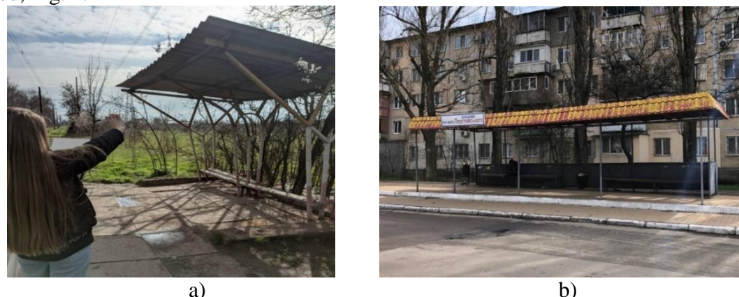
Fig. 2. Some of the investigated transport stops of the city of Odessa: a – Bus stop on the Paustovs`ka street v. Ilychanka, Odesa region; b – Tram stop «The city fridge» Novomycolayivs`ke highway

As a result of the analysis and inspection of local transport stops in Odesa, it was noticed that quite a few objects have an outdated appearance, look gray and boring, and the coatings are worn and frayed, Fig. 2.