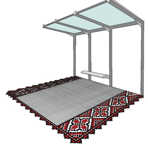
Fig. 5. The 3<sup>rd</sup> option of layout for paving slabs

The use of traditional Ukrainian ornament is becoming a fashionable trend in many areas of art, since it is indeed an interesting work of art and is successfully assembled (transformed) into both traditional and modern architecture. The importance of using regional embroidery in a semantic context is also important. The special veneration of ornamental art by our ancestors is explained not only by artistic and aesthetic qualities, but also by the power of a talisman that can protect from evil and adversity. For the development of sketches, such embroidery patterns of the Odesa region were used (Fig. 6) [4].