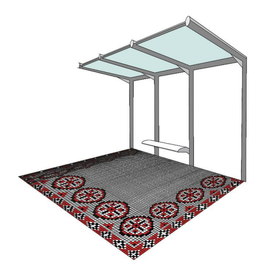
Fig. 3. The 1<sup>st</sup> option of layout for paving slabs

The use of regional embroidery in design reflects the strategy of promoting Ukrainian culture. The idea of combining architecture and art is not new, but today it is gaining new meaning. Russian aggression brought awareness of the vulnerabilities of the cultural sector, opened up many important questions that relate to the identity of Ukrainians. One of them is the issue of the heritage of cultural national values. History and art are the basis of the mentality of the people, and the modern Ukrainian city is the core through which the future of the state is focused, not only economic, but, above all, in ethical-moral, spiritual-cultural perspective. Therefore, it is believed that at the current stage of history, trends and phenomena of culture and art that contribute to the preservation, restoration, protection and popularization of the cultural values of art, architecture, in particular, to strengthen the modern Ukrainian identity, the formation of common values of society, require special attention and support [3]. The development of modernized Ukrainian-style infrastructure also contributes to this process. Therefore, as a solution to this issue, the following options for styling bus stops were developed (Fig. 3, Fig. 4, Fig. 5).